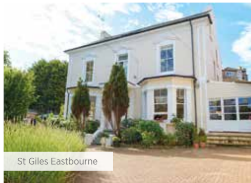
St Giles Eastbourne